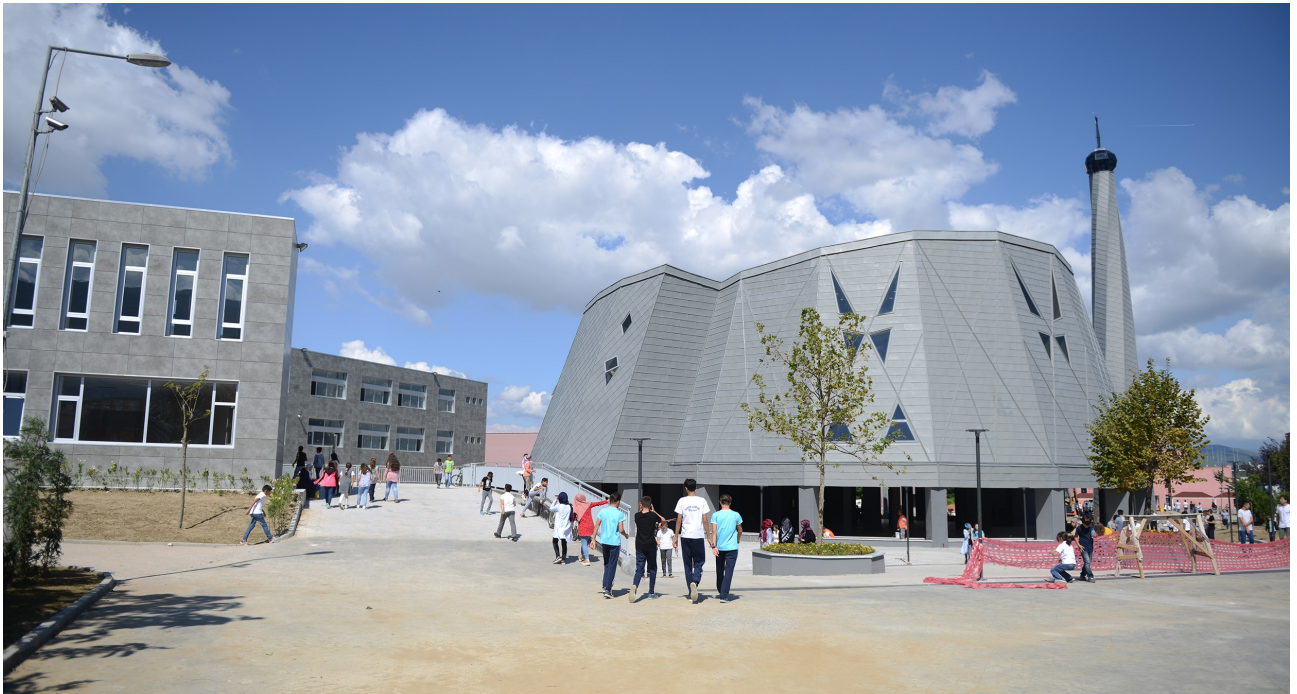
IMAGE BTSO Mosque

The success was achieved by appropriately organising the conditions and requirements of the project, selecting the right design-build contractor through the competitive tender, establishing the rules for design and construction process, monitoring the progress in accordance with the established rules, and providing appropriate technical advices.