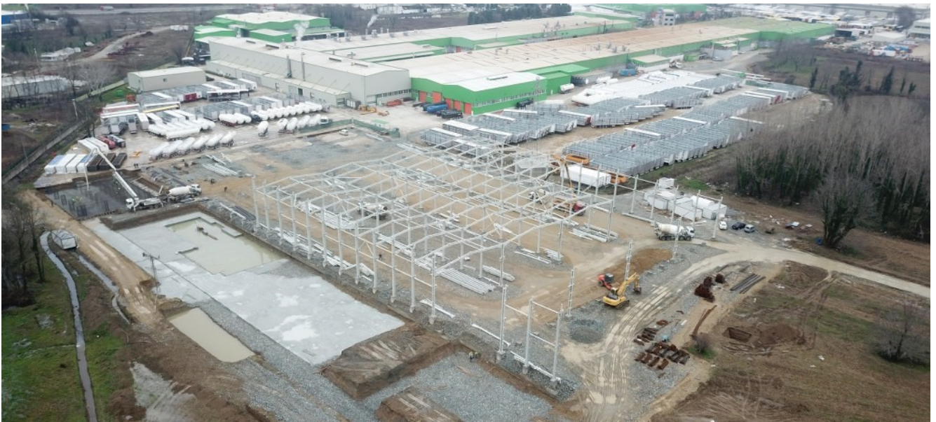
IMAGE Tirsan Kardan Factory

The success was achieved by appropriately organising the conditions and requirements of the project, selecting the right design-build contractor through the competitive tender, establishing the rules for design and construction process, monitoring the progress in accordance with the established rules, and providing appropriate technical advices. These factors contribute not only to the efficient flow of the project sequence but also to the successful control of the construction quality and project cost, which eventually led to a high level of the client's satisfaction for our services.